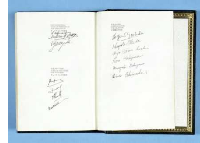
Treaty of Peace with Japan in 1951