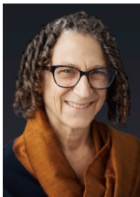
Prof. Cynthia Dwork

Field Eligible for the Award: Electronics, Information, and Communication