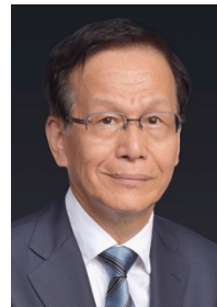
Prof. Shizuo Akira

Field Eligible for the Award: Life Sciences